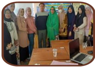
Figure 2: Digital Entrepreneurship Training for the Community

The community, particularly groups of youth and local entrepreneurs, successfully acquired fundamental skills in using digital platforms to promote tourism potential and local products. Several social media accounts and websites have been created by the community to support digital promotion. More than 70% of training participants are capable of creating and managing social media accounts for the purposes of tourism and creative economy promotion.