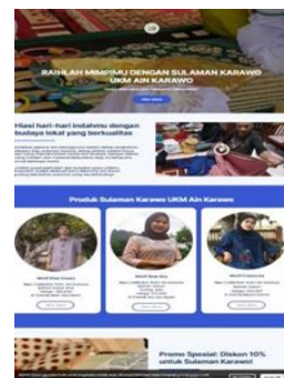
Figure 4. E-Commerce for Ain Karawo SMEs

Through digital marketing training, the community has successfully promoted tourist destinations and local products, such as Sulaman Karawo, to a broader market. Promotional content, including photos, videos, and articles in both Indonesian and English, has been consistently uploaded to social media platforms. This bilingual digital promotion has significantly increased the visibility of Dunggala's tourist destinations,