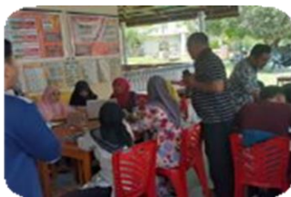
Figure 2. English Training

Participants in the English training program are now able to engage in basic conversations to serve foreign tourists. The bilingual training modules have been tailored to meet local needs, and community members have begun actively interacting with tourists in English. More than 50% of training participants are capable of conducting basic conversations in English related to tourism services. This newfound ability enhances their confidence and contributes to a more welcoming