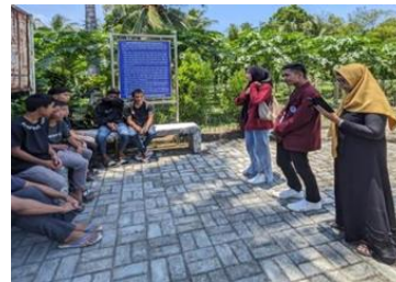
Figure 3. Environmental Cleanup at the Tomb of Raja Blongkod

The Dunggala community has begun to implement the concept of regenerative tourism through activities such as environmental cleanups and tree planting. Tourist destinations like the Tomb of Raja Blongkod and Rumah Alam Dunggala are being developed with a focus on ecological sustainability. There are concrete actions in place to protect and restore the ecosystems surrounding these tourist sites, including the implementation of waste management policies. These efforts not only enhance the natural beauty of the area but also promote a culture of environmental responsibility among community members and visitors alike.